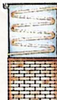
FRESH GRAPPA 78° ALCOOL

COIL CONDENSER The alcoholic vapours coming out from the column, are chilled by the coil with cold water inside. The Master Distiller separates now "HEAD, HEART, and TAIL" of the distillate. From 100 kg of grapes we obtain 3 bottles of Grappa.